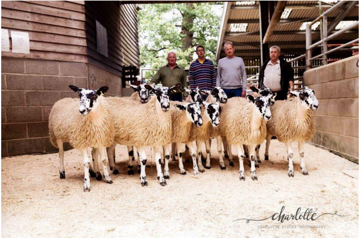
2 nd Prize Lambs from JC&N Throup